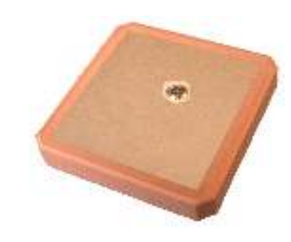
TW1015 Dimensions (mm)