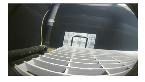
Figure 1: Sample Image

The Wide-i SeaCam does an exceptional job at giving a high quality wide angle image even in very low light conditions. This camera is capable of producing an incredible 125° (H) x 89° (V) degree field of view under water. Just like with any wide angle lens, users should be aware of vignetting effect (black corners). Figure 1 below shows a standard still image taken from the Wide-i SeaCam clearly showing the vignetting effect on the four corners of image.