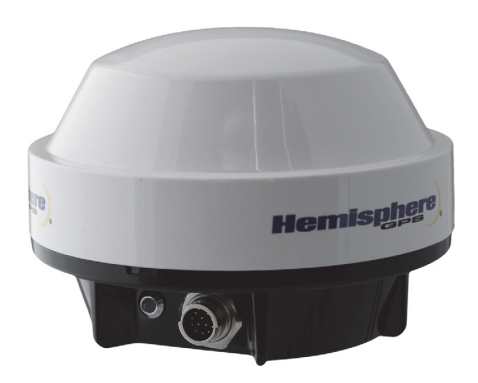
Figure 1-1: A325 smart antenna

Note: Throughout the rest of this manual, the A325 Smart Antenna is referred to simply as the A325.