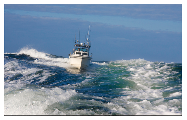
What Environmental Forces are at Play?

The concept of a "Smart Boat" starts with a standard boat and integrates valuable advanced technology to enhance the boat's performance in open water. These enhancements are typically in the form of integrated sensors or displays. Assisted Docking and Virtual Anchoring are two key technologies that identify a Smart Boat. Within these two technologies, the GNSS performance is of the highest importance, always delivering precise and quality performance.