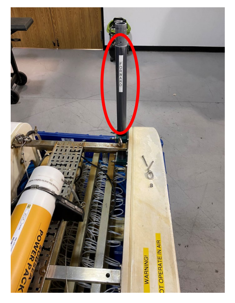
"Forward" indicated with label

Once the pole is inserted, ensure that "FORWARD" label is facing the front of the catamaran. Secure all 4 nuts with a 9/16" wrench.