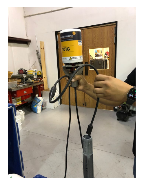
Feed the cable trough opening

Remove and retain the fasteners from the top of the mounting pole. Feed the antenna cable through the pole. Do this until all cabling is through and secure the bracket on top of pole.