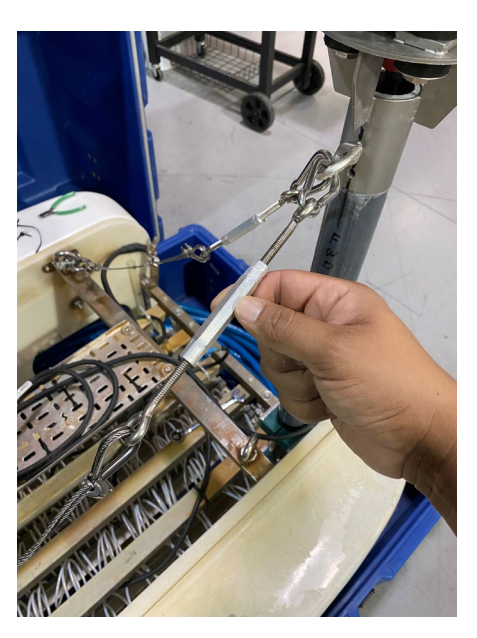
Locate and tighten both turnbuckles