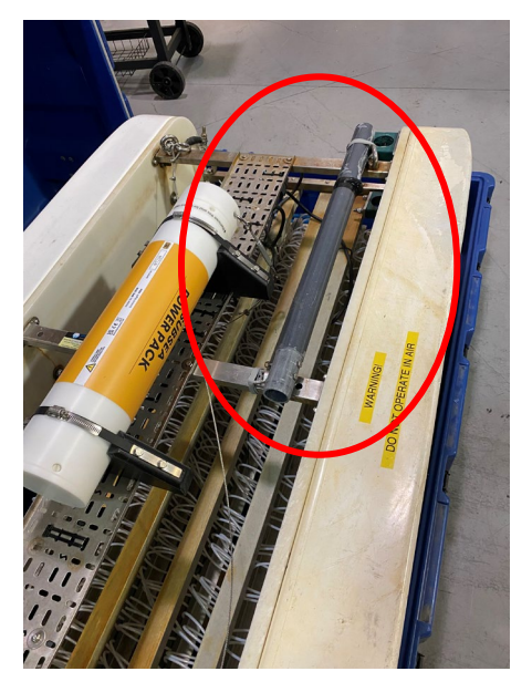
Pole secured for shipping

1. – <u>Securing the pole:</u> Remove pole from its shipping position. Insert bottom of mounting pole into the green bracket clamps. Pole should only go as far as black stopper allows.