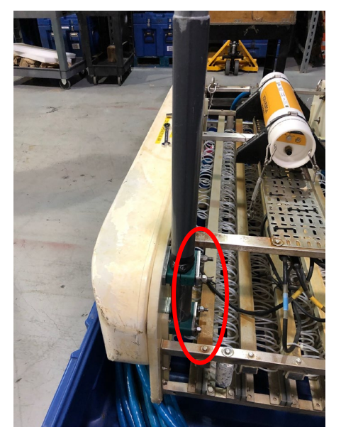
Tighten all 4 nuts

2. – <u>Mounting the GPS Antenna:</u> Locate and remove the GPS antenna from its transit case. Bracket and cable are already connected and <u>do not</u> need to be disassembled.