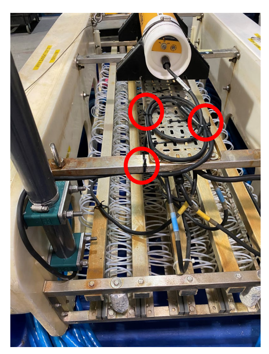
Loose cabling ziptied