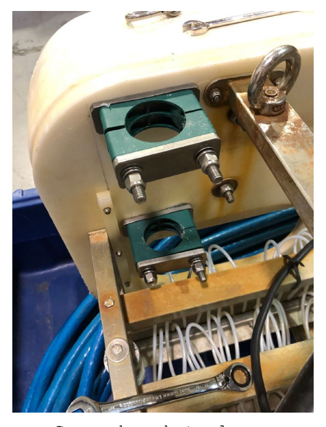
Green bracket clamps