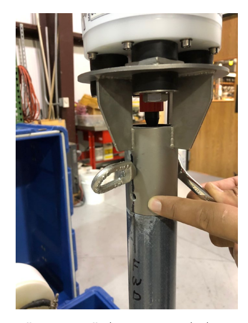
"eye nut" in top position

Reinsert fasteners gently through bracket, making sure to keep the cable out of the way. Position the "eye nut" in the top position. Use 7/16" wrench to tighten.