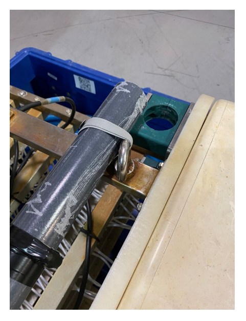
Bottom of the pole indicated with markings