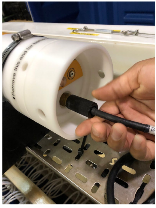
Connect to Subsea Power Pack