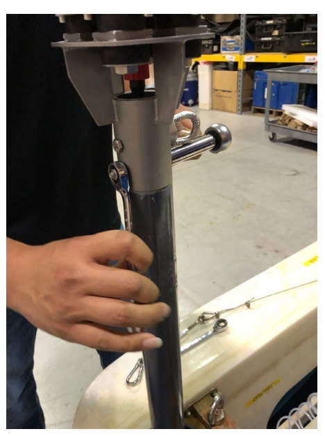
7/16" wrenches used