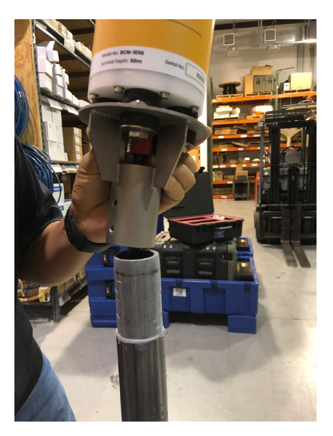
Fit together bracket and pole

Reinsert fasteners gently through bracket, making sure to keep the cable out of the way. Position the "eye nut" in the top position. Use 7/16" wrench to tighten.