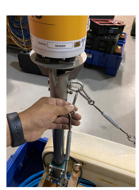
Secure both clips to "eye nut" on antenna mount