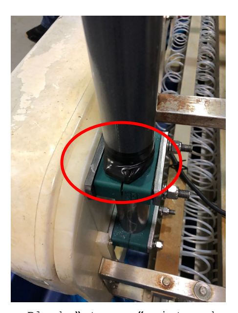
Black "stopper" pictured